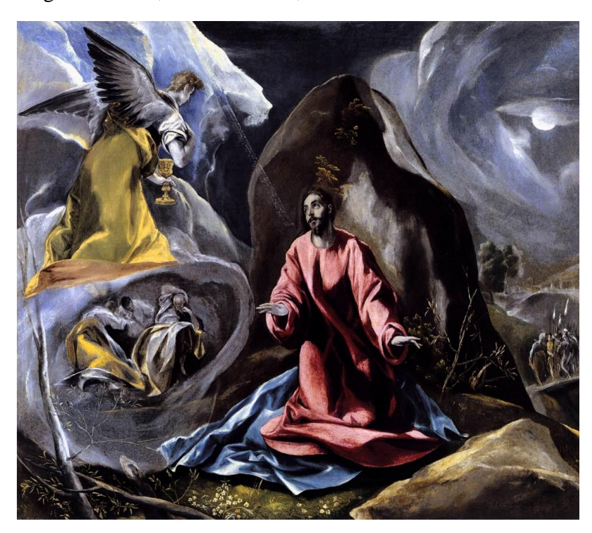
Figure 2: El Greco, The Agony in the Garden of Gethsemane . This painting was part of the Herzog Collection and considered one of El Greco's most notable works.

Baron Mór Lipót Herzog (1869-1934) was a prominent Jewish banker in pre-war Hungary. He was also a passionate art collector. Throughout his lifetime, Herzog was able to accrue more than 2,000 paintings, sculptures and various other works of art. The accumulation of artwork became known as the "Herzog Collection." It was considered one of Europe's largest private collections of art and it was the largest collection of art in Hungary. The Herzog Collection contained various works of art by many well-known artists such as El Greco, Diego Velázquez, Pierre-Auguste Renoir, Claude Monet, and Gustave Courbet.